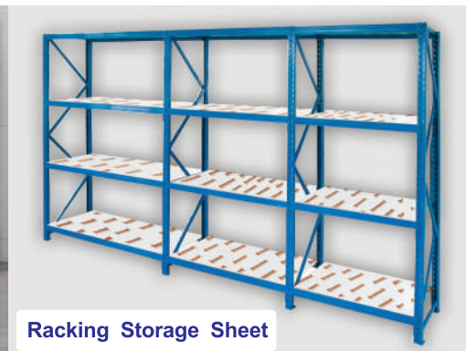
Racking Storage Sheet

LOOKS LIKE WOOD, FEELS LIKE WOOD & LASTS LONGER THAN WOOD