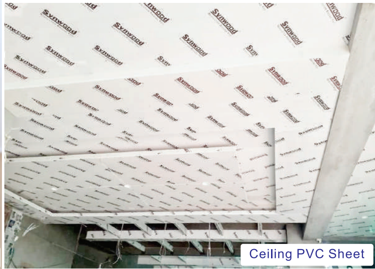
Ceiling PVC Sheet